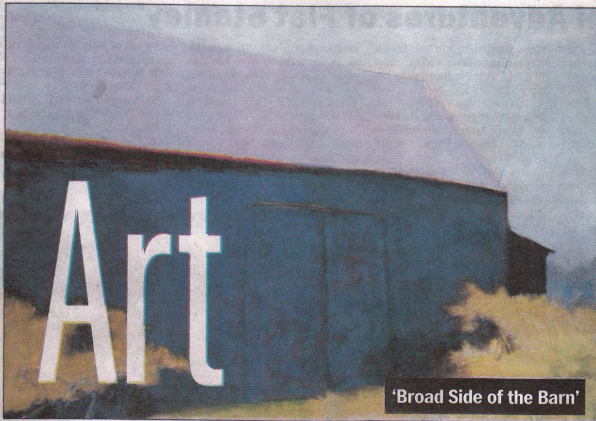
'Broad Side of the Barn'