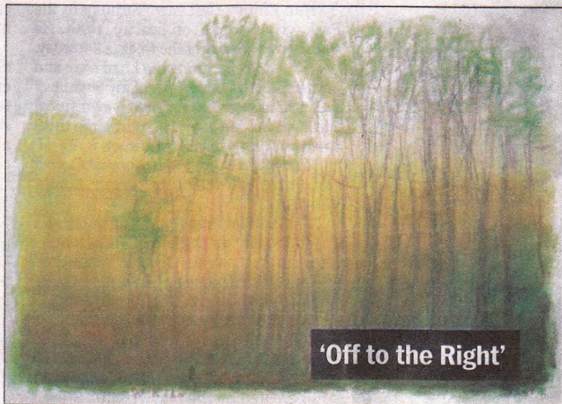
'Off to the Right'